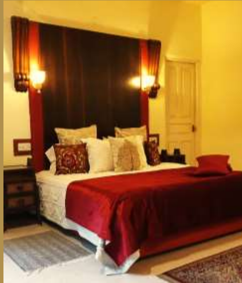
Rai Bahadur Luxury Room ranges from 300 sq. ft. onwards