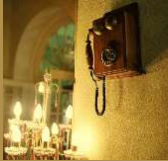
Ratnavali Suite ranges from 800-1000 sq. ft.

Individual Heating & Cooling units A few of the bathrooms have a claw foot tub Mini-Fridge in Suites