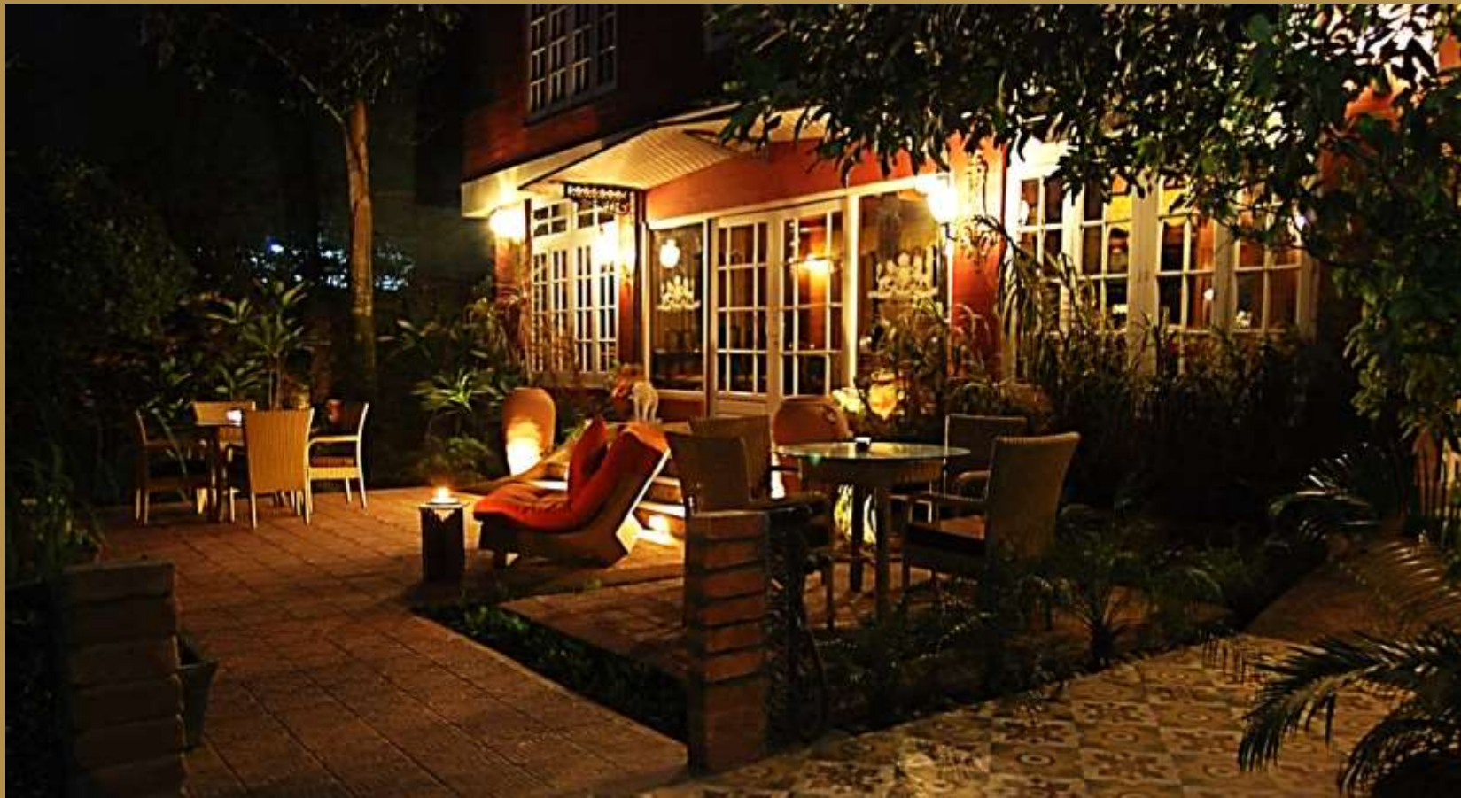
Dining By the Garden